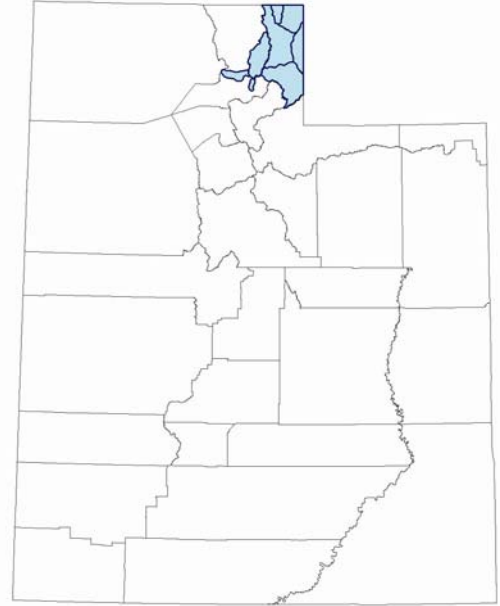
Figure 7. The Rich County Coordinated Resource Management (RICHCO) Sage-grouse Local Working Group Conservation Area consists of 661,760 acres located in north-eastern Utah.

This information below summarizes efforts made by individual and partners to address threats and strategic actions for the Rich County Greater Sage-grouse Local Conservation Plan. This adaptive plan is in effect until the year 2016. RICHCO partners not only reported on specific actions completed or addressed in 2009-2010 but also identified steps to be taken to implement addition actions into subsequent years of the plan. For the complete list of threats identified by the RICHCO group, see page 64 of the conservation plan located on line at http://utahcbcp.org/files/uploads/rich/RICOSAGRPlan_Draft1.pdf