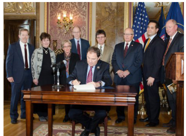
Governor Gary R. Herbert (seated in center) signing an Executive Order to help ensure healthy habitat for greater sage-grouse balanced with the best interests of the citizens of Utah.

Greater sage-grouse currently are found in 11 states with approximately 4 percent of the total bird population living in Utah. "Utah is committed to good environmental stewardship. Signing the executive order has to be done in a serious and thoughtful way, addressing the bird's habitat, as well as the needs of society, private landowners and the economy," said Gov. Gary R. Herbert. "Today is an important step forward for us and I believe it shows we are serious about protecting