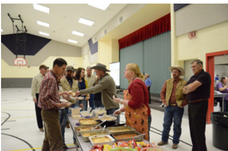
Dinner was provided by the Park Valley EMTS as a fundraiser to support their program.