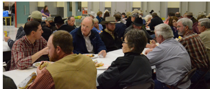
Landowner dinner participants.