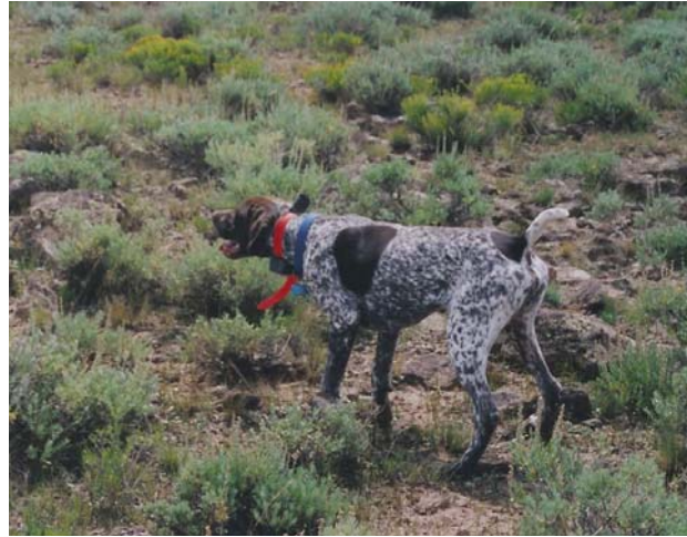
Buddie points a sage-grouse hen on Parker Mountain.