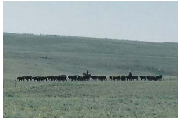
Cattle grazing a Utah prairie dog treatment pasture on Parker Mountain.

In spite of their important ecological role, prairie dogs have been the nemesis of many ranchers. Dwayne Elmore's research is starting to change that. With the cooperation of local rancher Gary Hallows and his cows, Dwayne is researching the effect of grazing intensity on Utah prairie dogs. The grazing may also help enhance habitat for sage-grouse (brood-rearing habitat) and livestock (forage production) by increasing the grass/forb component. Dwayne is monitoring the response of the prairie dogs and the vegetation in the pastures to evaluate differences.