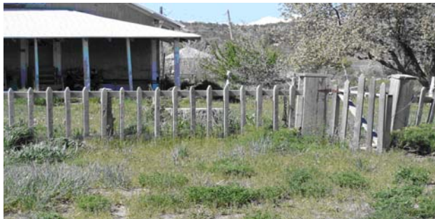
Alton front yard favored by female sage-grouse.

Trapping efforts will begin again shortly to get some females collared as well as more males. In the meantime, UDWR and BLM are working on some habitat improvements in the area. An SUU undergraduate technician is collecting vegetation and insect data on her planned project before the plan is implemented. Similar data will then be collected each summer following the treatments to chart the changes to the landscape.