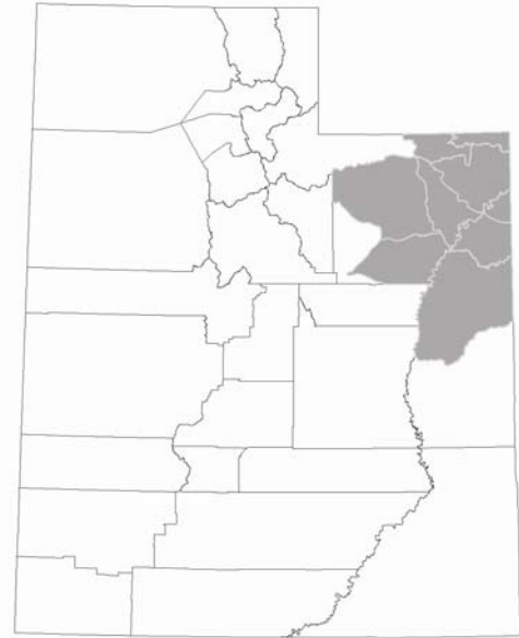
Figure 10. The Uintah Basin Adaptive Resource Management (UBARM) Sage-grouse Local Working Group Conservation Area consists of 5,375,423 acres located in eastern Utah.

Beginning in 2009, the group has an informal agreement to coordinate meeting times and field tour dates with the Uintah Basin (northeast region) Utah Partners for Conservation and Development (UBPCD), which meets approximately monthly. This allows for better coordination of projects and issues, in addition to facilitating higher attendance from partners who might otherwise be forced to choose between the two meetings for budgetary purposes. The UBPCD group also passed a resolution in December 2008 to support implementation of the UBARM sage-grouse conservation plan.